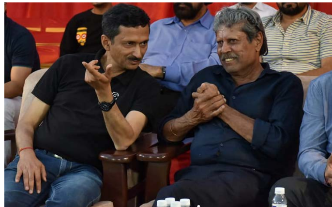
In conversation with glorious cricketer Mr. Kapil Dev at a popular cricket tournament organised by UT Cricket Association, Chandigarh.

fortnightly column, "Random Forays," in the Hindustan Times. His latest books, "IT'S A WONDERFUL LIFE" and "FINDING SUCCESS WITHIN," delve into the importance of SEL and personal growth.